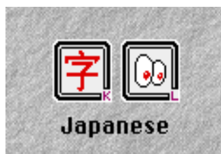
Figure 3 The Kanji and Look buttons

Now for some more advanced searching. Press Zap to empty out all the information in the Find Word dialog again, and then press the Kanji button (see figure 3 below) - the Select Kanji dialog will appear. Type in 'nichi' (as the Kanji reading), press the Find Kanji button (the button with the Kanji character in it) and click the single Kanji that comes up to select it. You'll notice the 'nichi' Kanji appear in the Find Word dialog.